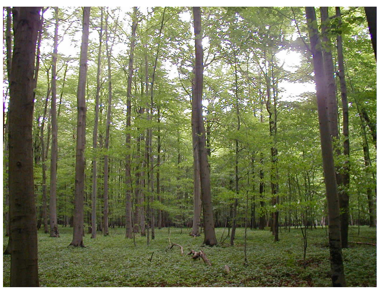
Figure 1: Understory of the Hainich FLUXNET site

Cozzarelli, N. R. (2004) Responsible authorship of papers in PNAS, Proceedings of the National Academy of Sciences of the United States of America, 101 (29), 10495-10495