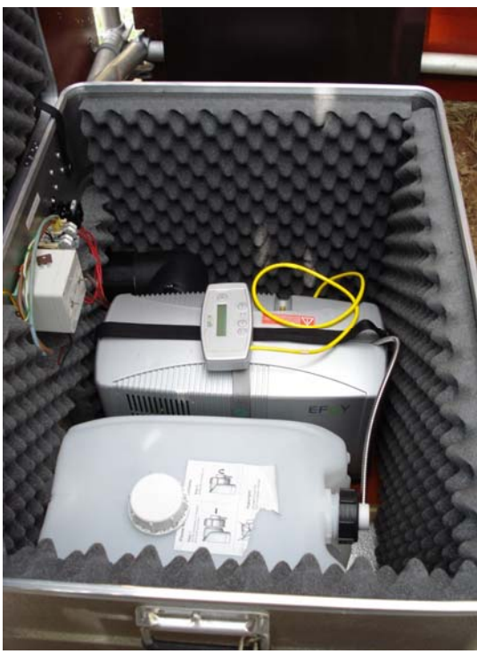
Figure 1: Direct methanol fuel cell installed at Loobos site

carbon dioxide and water." (Direct methanol fuel cell. (2008, September 10). In Wikipedia, The Free Encyclopedia. Retrieved 13:10, September 10, 2008, from: http://en.wikipedia.org/w/index.php?title=Direct_methanol_fuel_cell&oldid=237505556