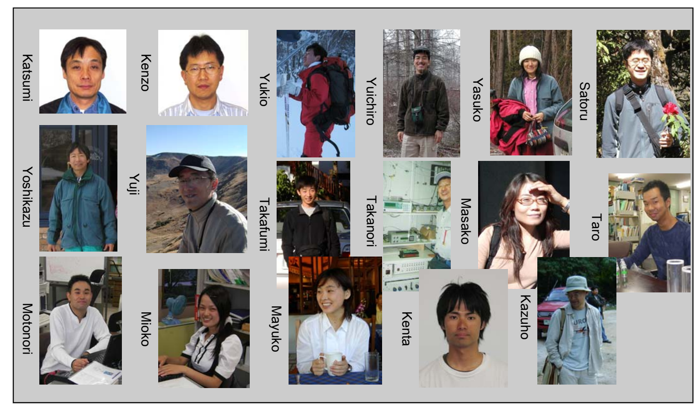
Figure 2: FFPRI team

"FFPRI started the flux observation of heat, water vapor and carbon dioxide at the Kawagoe site in 1995. After the establishment of the fundamental instrumentation, the observation was extended to other six forest sites. This group of sites is named FFPRI FluxNet, since 1999."